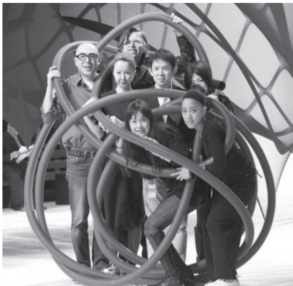
Dai Fujiwara, Bill Thurston, & Issey Miyake Designers

In spring 2010, the Clay Institute announced that the Millennium Prize for the Poincaré conjecture was awarded to Grigoriy Perelman. As he had done earlier with the Fields medal, Perelman refused the Millennium Prize of $1 million but the mathematical community celebrated Perelman's astonishing achievements including his proof of the geometrization conjecture at a conference held at Institut Henri Poincaré in Paris in June 2010. Of course, Bill Thurston was one of the featured speakers at this conference.